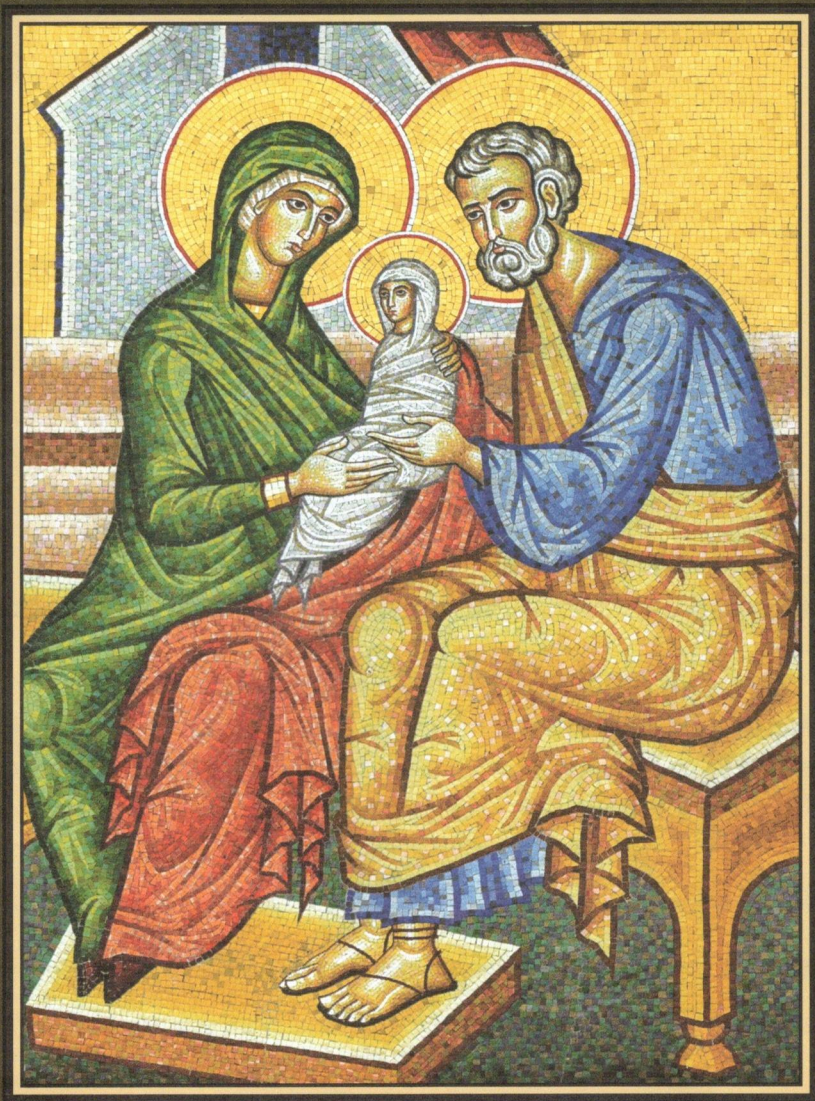
The Blessed Virgin Mary with her parents Joachim and Anna